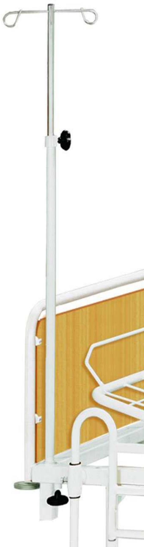
Stand for infusion holder