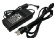
AC Adapter (90W, 100-240VAC)