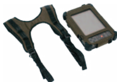
Shoulder Harness Bag (4-point; Handsfree)