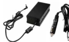
Vehicle Adapter (90W, 11-16VDC and 22-32VDC)