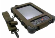
Shoulder Strap Bag (2-point)